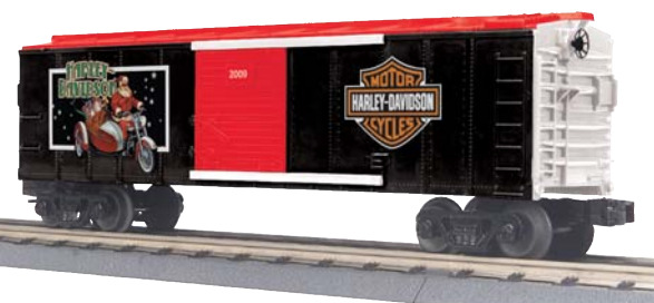
Harley-Davidson® Box Car 30-74544 $44.95