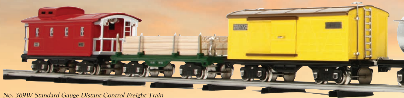
No. 369W Standard Gauge Distant Control Freight Train

Advertised in Lionel's 1934 catalog as one of the "largest and most powerful locomotives built", the 385 and 1835Es were much less expensive than their larger counterparts, the 400E and 392E. The 1835E included a patented hinged boiler front, which concealed a working headlight bulb, and colored signal lights and number plates, which were all illuminated by the same lamp. This 2-4-2 locomotive offered all of the same details as the 385E, but with black rather than plated piping, and at a price that could appeal to any model-railroading enthusiast. The 1835E's simple body and modest paint scheme allow the quality and history of this locomotive to speak for itself.