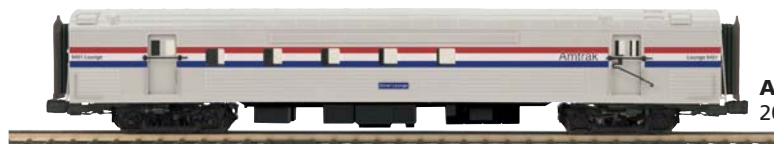
Amtrak - 70' ABS RPO Passenger Car (Ribbed) 20-68151 $89.95