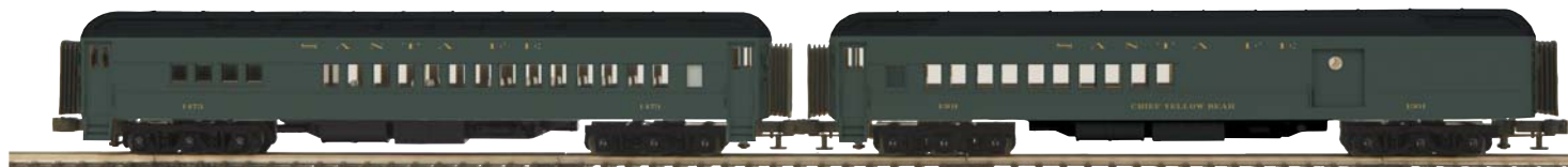
Santa Fe - 2-Car 70' Madison Comb/Din Passenger Set 20-41006 $159.95