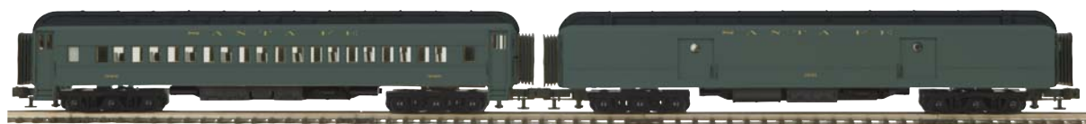
Santa Fe - 2-Car 70' Madison Baggage/Coach Passenger Set 20-44006 $159.95