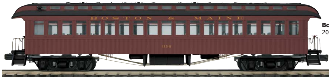
Boston & Maine - 64' Woodsided Coach 20-62037 $89.95