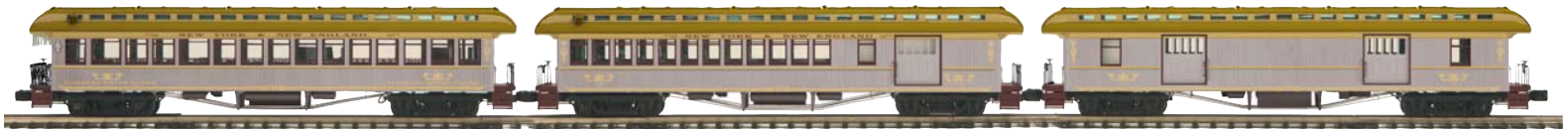
New York & New England - 3-Car 64' Woodsided Passenger Add-On Set 20-62035 $259.95