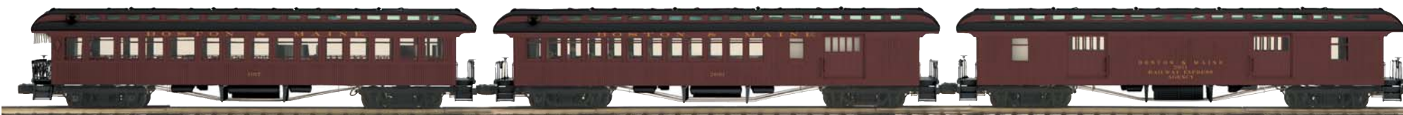
Boston & Maine - 3-Car 64' Woodsided Passenger Add-On Set 20-62038 $259.95