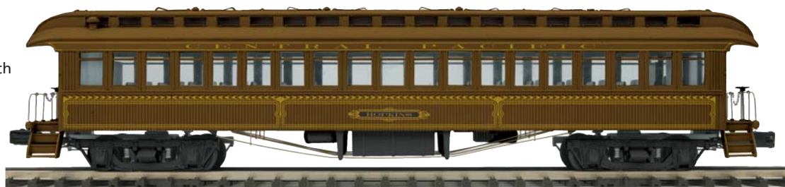
Central Pacific - 64' Woodsided Coach 20-62040 $89.95