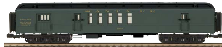
Santa Fe - 70' Madison RPO Passenger Car 20-42006 $89.95