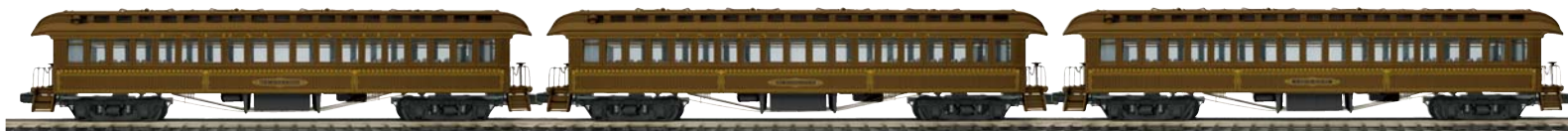
Central Pacific - 3-Car 64' Woodsided Passenger Set 20-62039 $259.95