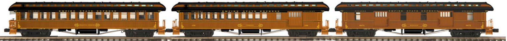
New York Central - 3-Car 64' Woodsided Passenger Add-On Set 20-62030 $259.95