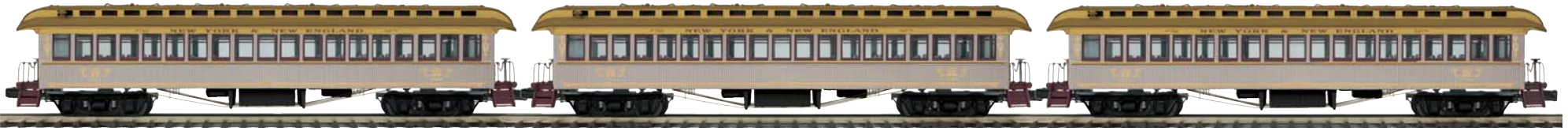
New York & New England - 3-Car 64' Woodsided Passenger Set 20-62033 $259.95