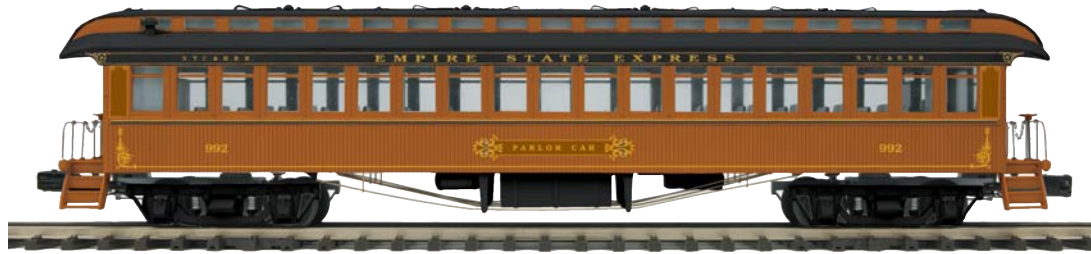
New York Central - 64' Woodsided Coach 20-62032 $89.95