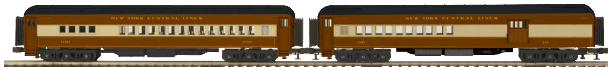
New York Central - 2-Car 70' Madison Comb/Din Passenger Set 20-41005 $159.95