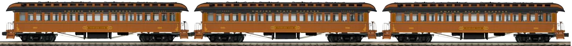
New York Central - 3-Car 64' Woodsided Passenger Set 20-62031 $259.95