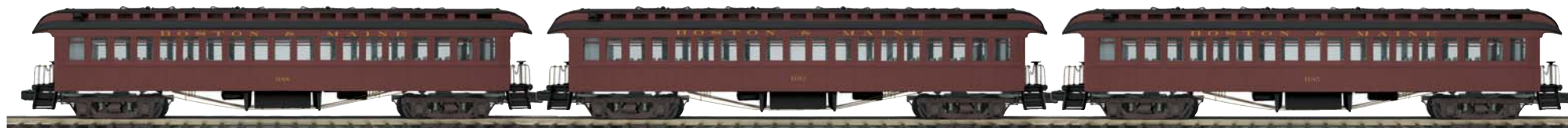
Boston & Maine - 3-Car 64' Woodsided Passenger Set 20-62036 $259.95