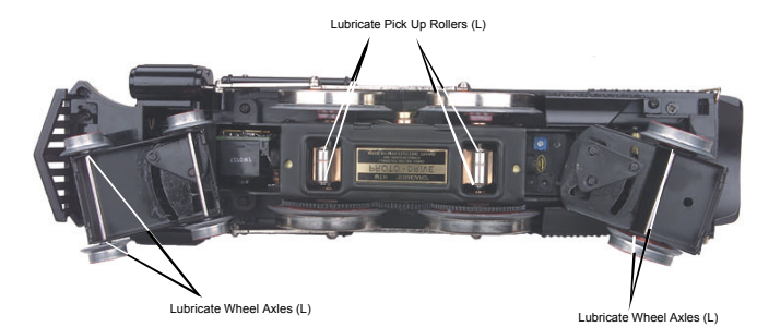
Figure 1. Lubrication Points on the Locomotive

You should lubricate the engine to prevent it from squeaking. Use light household oil and follow the lubrication points marked in Figures 1 and 2. Do not over-oil. Use only a drop or two on each pivot point. Make sure you lubricate all side rods, leading and trailing trucks and drive wheel axles.