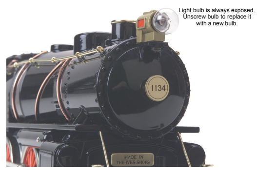
Figure 4: Accessing The Locomotive Headlight

Gently unscrew the bulbs from the socket on the mounting bracket and replace the bulb.