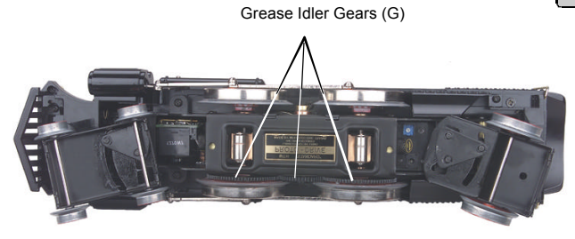
Figure 3: Ilder Gear Grease Points

Regularly lubricate all axles and linkage components and pickup rollers to prevent squeaking. Use light household oil, such as that found in M.T.H.'s maintenance kit. Do not over oil. Use only a drop or two on each pivot point.