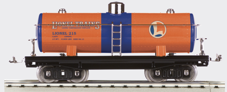
Lionel Lines - No. 215 Std. Gauge Oil Car 11-30131 M.S.R.P. $129.95

Originally catalogued in 1940 this 2654 O gauge tank car came equipped electric remote control couplers, aluminum finishing, and bright nickel detailing. Catalog numbers, initially in the 600 series, were changed to the 2600 series when new automatic couplers were added in 1938. Part of the 2600 rubber stamped freight car series from M.T.H., this car features baked enamel finishing, stamped steel body and chassis, metal wheels and axels, and operating metal latch couplers. "In designing this marvelous new series of Lionel 'O' Gauge Freight Cars, our aim has been to express the individuality of every type of commercial freight car used on all railroads. Many new features never before carried out to such perfection are apparent in these cars."