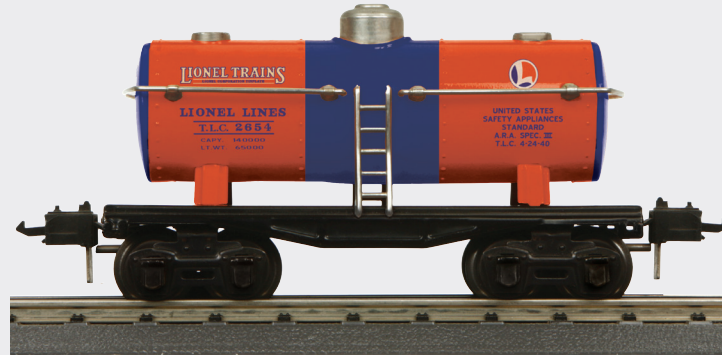
Lionel Lines - No. 2654 O Gauge Tank Car 11-70076 M.S.R.P. $69.95

In 1926, Lionel replaced the primitive-looking large-size freight cars it had cataloged for 20 years with the new 200-series standard gauge cars: "Not only are these new cars patterned after the big all-steel cars that carry freight across the country, but they incorporate many original and exclusive features of design that only Lionel can carry out to such perfection... The illustrations clearly show that every known type of modern car is faithfully reproduced by us. It is great fun to convert your 'Lionel Standard' Passenger Train into a big Freighter by adding an assortment of these well-built and handsomely finished cars." The 200-series cars were cataloged as "for use with Locomotives Nos. 380E, 381E, 402E, 408E and 400E," although on one occasion, in the 1930 catalog, they appeared in a Deluxe set with the smaller 390E steamer.