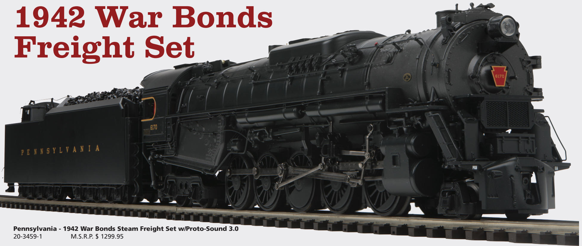
Pennsylvania - 1942 War Bonds Steam Freight Set w/Proto-Sound 3.0 20-3459-1 M.S.R.P. $ 1299.95

The J1 was the Pennsy's War Baby, conceived and born to move freight for World War II. Like most American railroads, the Pennsylvania found itself short of motive power when traffic ramped up for the war. The Pennsy would have preferred to design its own modern steam loco, but the War Production Board declared otherwise. Only existing, proven designs would be authorized for wartime construction. In retrospect, that was probably a good thing, because none of the Pennsy's postwar steam designs came close to the success of the J1.