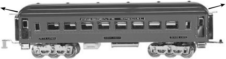
Fig. 2 Pulling the latches outward on either end of the Passenger Car to release the roof

First, pinch the spring-loaded roof tabs together. The roof will be freed from the car body, exposing the interior of the car (see Figure 2, below).