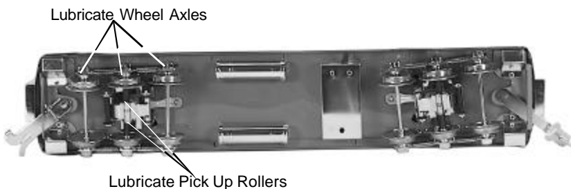
Fig. 1 Lubricating the Passenger Car

Use a light household oil for lubrication. Apply oil sparingly, using a toothpick or small applicator. Add a drop of oil to the axle holes in the front and rear of each wheel, to each side of the pickup roller axle, and above and below the clip on the coupler arm pivot (see Figure 1, below). Wipe away excess oil with a cotton swab.