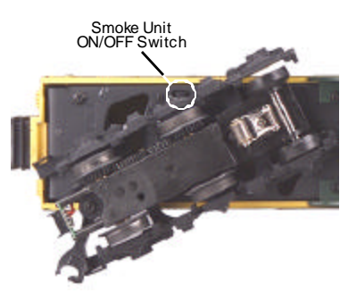
Figure 4. Smoke Unit ON/OFF Switch