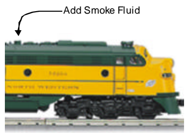
Figure 3. Add Smoke through the Front Smokestack

When storing the unit for long periods of time, you may want to add about 15 drops of fluid to prevent the wick from drying out.