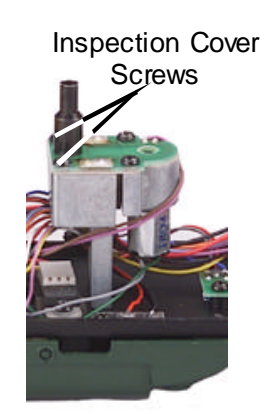
Figure 5. Inspecting the Smoke Unit

Replacement parts and wick replacement instructions are available directly from the M.T.H. Parts Department