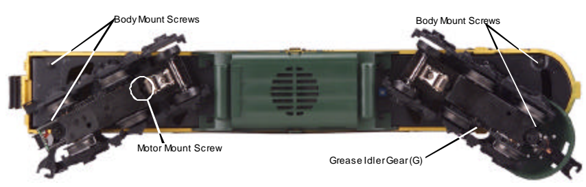
Figure 7. Location of Body Mount Screws and Greasing Points on the Locomotive

Periodically check the locomotive wheels and pickups for dirt and buildup, which can cause poor electrical contact and traction as well as prematurely wear out the neoprene traction tires.