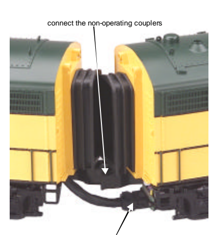
connect the wining hamess Figure 1. Connecting the Units Together.

At this point, you are ready to begin running your engine.