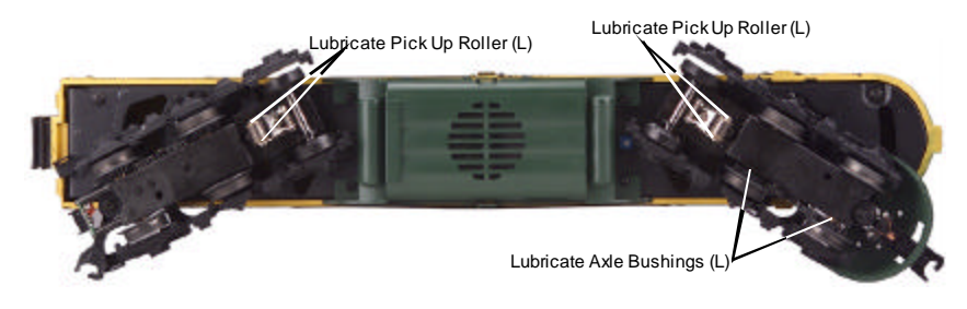
Figure 6. Lubrication Points on the Locomotive

You should regularly lubricate the engine to prevent it from squeaking. Use light household oil and follow the lubrication points marked "L" in Fig. 6. Do not over-oil. Use only a drop or two on each pivot point.