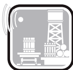
Freight Yard Sound