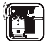
Passenger Station Announcement

PLEASE READ THE MANUAL BEFORE USE AND SAVE WWW.MTHHOTRAINS.COM